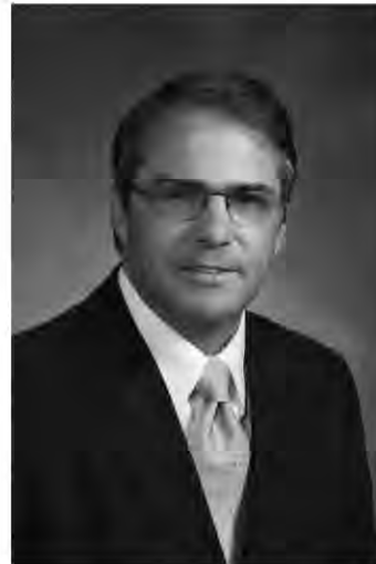
State of Washington Lieutenant Governor Brad Owen